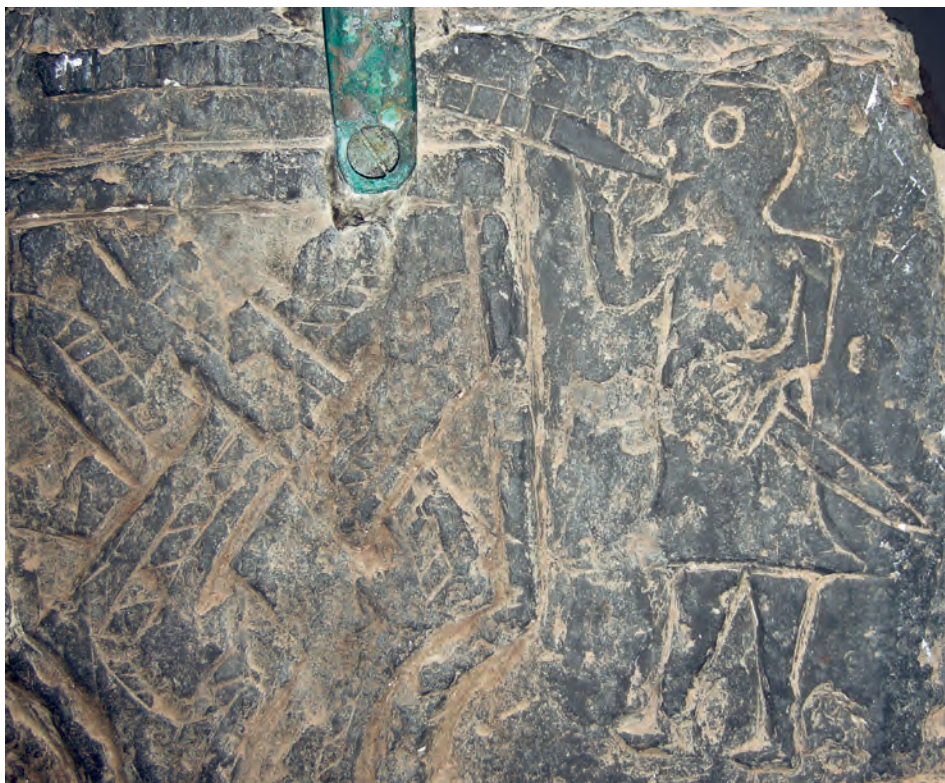
Fig. 7. Jurby 127.

This is also known as ‘Thor’s Cross’; some researchers have seen various myths involving the god Thor in its ornamentation. On one side of the cross, below the circle to the right, a man with a beard and a belt is depicted who might be Thor, the red-bearded god. Thor is the son of Odin and Jord (Earth), the guardian of the gods, and