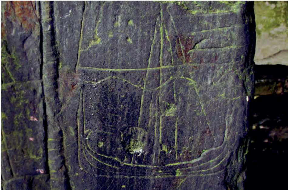
Fig. 6. Maughold 142.

The cultural richness of these stones and their inscriptions is unique to the Isle of Man, and are some of the many reasons that make the Island well worth studying and exploring.